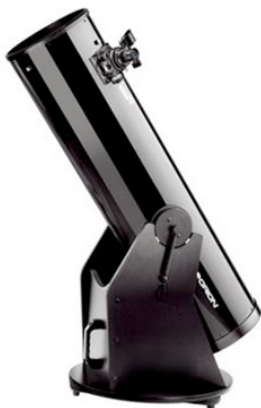
Orion SkyQuest 10" f/4.7

ASLC members have access to the club's loaner scopes. These are telescopes that have been donated to the club and checked/restored by one of our members. The scopes may be used locally, used for outreach activities or taken to star parties. There is a wide variety of available scopes including a 10" Orion reflector, an 8" Celestron SCT ('C8') and an Orion 12" Intelliscope. For a complete list of available scopes, please contact the coordinator at LoanerScopes@aslcnm.org .