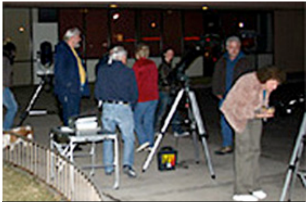
On Saturday evenings around the first-quarter moon, club members host our monthly Moon Gaze event at one of a few regular locations in the city.

Although several ASLC members collect scientific data, most of us do astronomy for fun. For example, the ASLC hosts public observing events such as our monthly MoonGaze and dark-sky observing at the club's observatory in Radium Springs. We also support countless star parties for local schools, scouting groups, and other organizations. For new telescope purchases, the ASLC is always willing to help with equipment recommendations and/or training. And, for those members who don't own a telescope, we offer the free use of equipment via our telescope loaner program. Our monthly club meeting is usually on the fourth Friday of each month. Please feel free to join us!