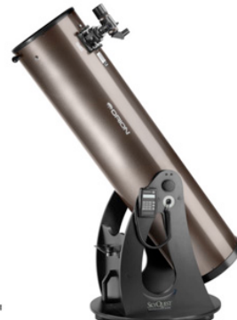
Orion Intelliscope (12")