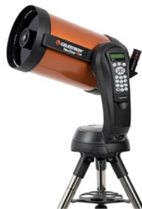
Celestron 8" SCT