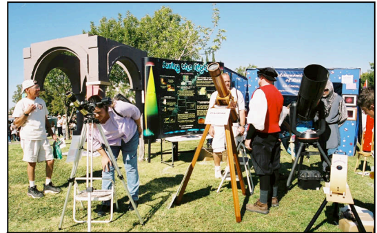
Participants view the sun and bright planets at ASLC's booth at the annual Renaissance Faire.

Renaissance Faire: Each November, the Las Cruces Fine Arts Council hosts a Renaissance Faire at Young Park. The two-day event draws thousands of local residents. ASLC has been a participant for the last several years. The club sets up telescopes through which individuals can safely view the sun. We also display astrophotography, demonstrate telescope building, and talk with hundreds of interested individuals about club activities (all the while wearing period costumes). In 2004 and 2018, the club won awards for having the best-costumed booth. It's great fun!