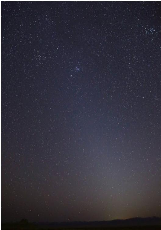
The zodiacal light as seen in the evening of March 1, 2021 above Skull Valley, Utah. The Pleiades star cluster (M45) is visible near the top.