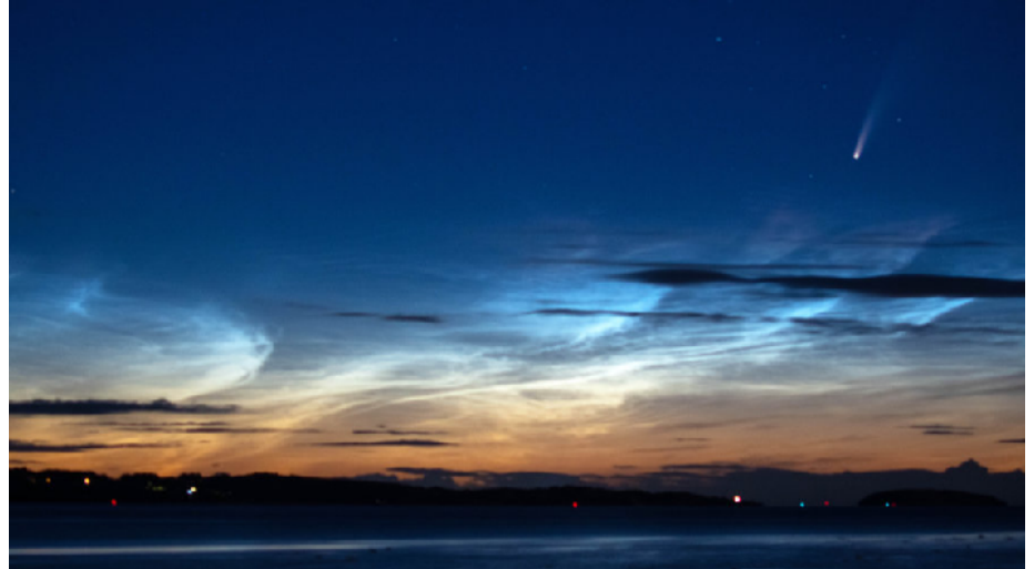
Comet NEOWISE flies high above a batch of noctilucent clouds in this photo from Wikimedia contributor Brwynog.

Their glow is caused by the Sun, whose light still shines at that altitude after sunset from the perspective of ground-based observers.