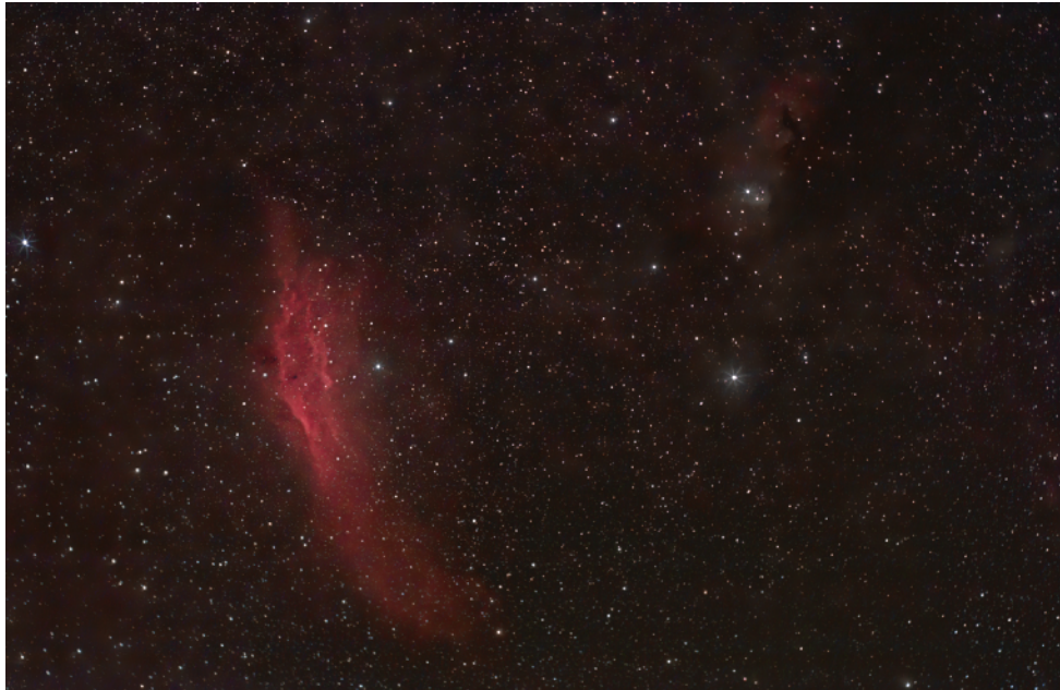
Imaged at Rusty's, Rodeo NM - October 2020