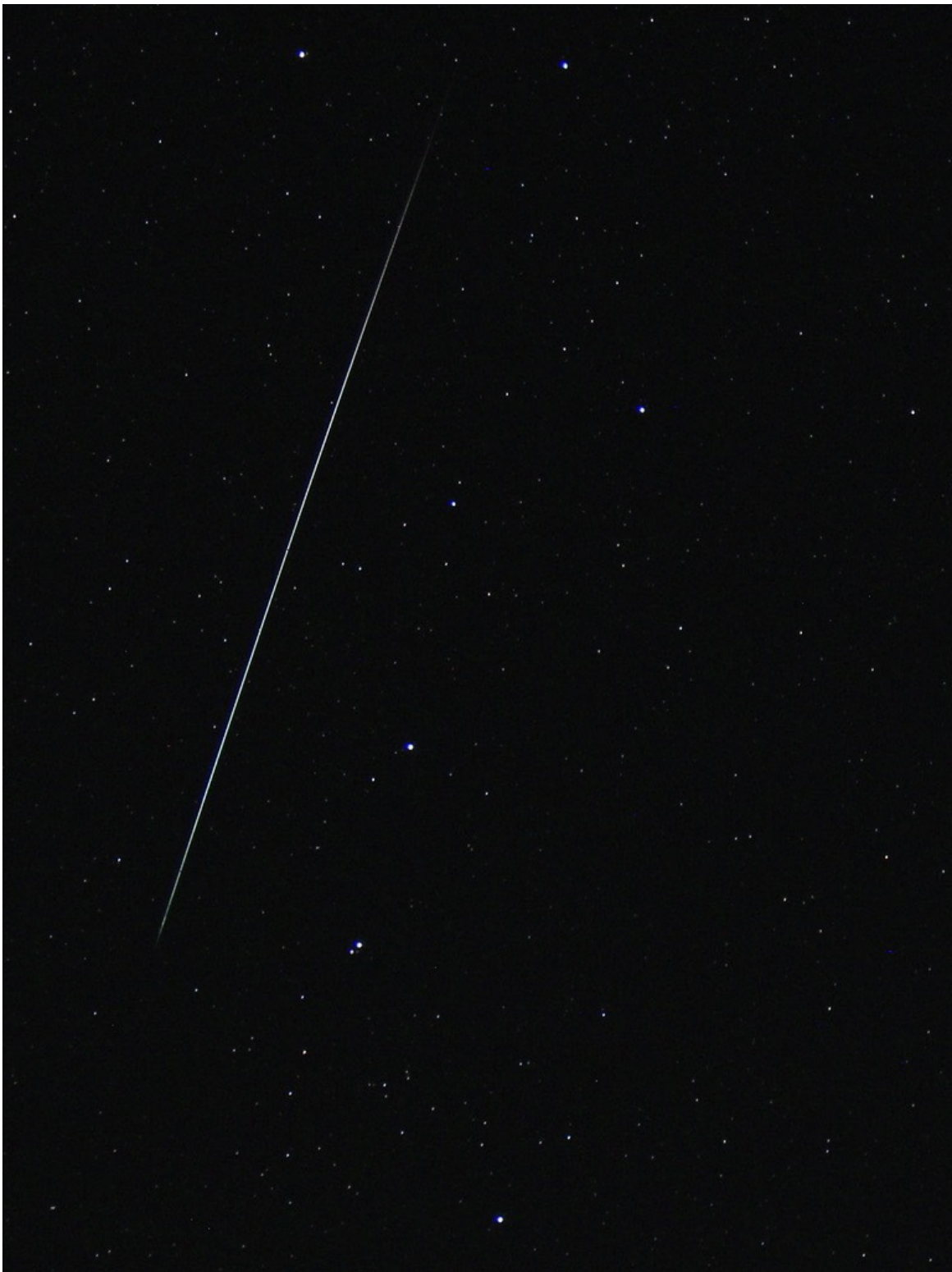
December 14 - Early Morning - Las Cruces NM