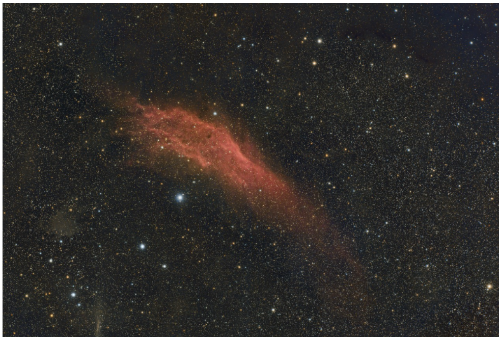
Image was taken with W.O. Redcat telescope and ZWO ASI6200 camera. Roughly a 7 hour LRGB combination. Imaged at Rusty's, Rodeo NM - October 2020