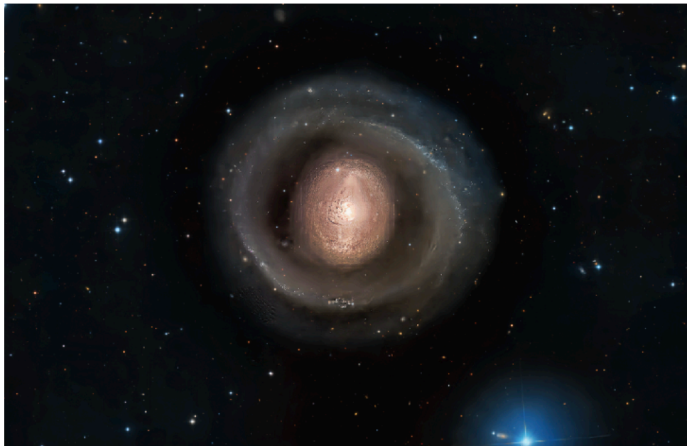
Data processed from Telescope Live Remote Observatory. My objective in processing this image was to reveal any structure present in the central bulge. Other images show some of the structures in this and other lenticular galaxies (see insets on https://en.wikipedia.org/wiki/Lenticular_galaxy ). Revealing the details demanded differentiation of subtle contrasts that I would typically ignore and which required multiple tools that could each contribute an increment to that task