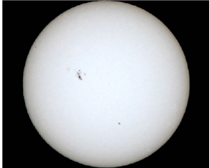
This is a whole-sun image I took with a sunspot group spanning over 150,000 km.