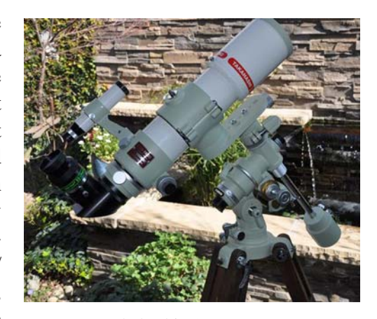
Takahashi P2Z mount

The Takahashi P2Z is also a current mount and probably provides the most accurate tracking of any of the lightweight Tak mounts. This is a more substantial mount than the Sky Patrol models. And unlike the Sky Patrol, the P2Z is a typical GEM in design. The P2Z weighs about 15 lbs (twice as much as the Sky Patrol) and has a capacity of about 15 lbs, but could probably take much more. The P2Z is often called the "baby NJP" since both mounts have the same RA worm gear which has a reputation for providing very accurate tracking. As with the Sky Patrol, this mounts only has an RA motor. With a good polar alignment, it provides excellent imaging results at image scales above 5arcsec/pixel. This mount has a built in, illuminated, polar alignment scope, again much like the one supplied with the much larger NJP mount. The P2Z is probably the best small mount on the market from the stand-