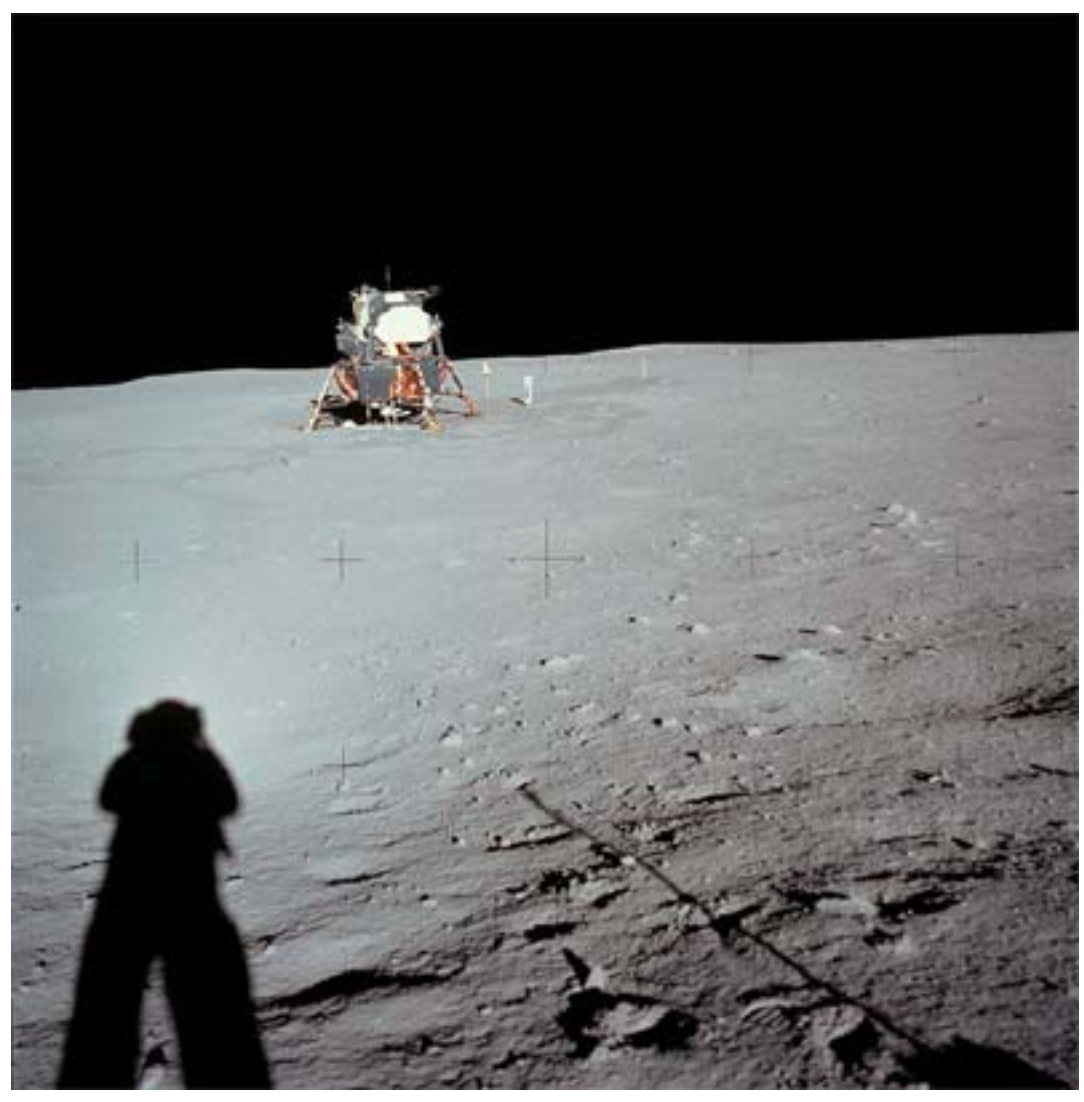
Looking back at the LEM at the end of the Apollo 11 moonwalk

Forty years ago next month, the first moon landing and moonwalk took place. For anyone who experienced it, it's a day they will never forget. For me it was the constant worry of would they make it? Would the long and fragile daisy chain of technical events that had to go just right, remain intact? Would man and machine be up to the challenge? It's easy to forget with the passage of time, but back then, no one really knew. The world collectively held its breath as they neared the surface. My memory of that event is still as clear as if it were yesterday, A hazy, humid, New England July afternoon, sitting in the screened porch, watching the animation of the LEM nearing the surface followed by the sharp sense of relief at the words "Tranquility Base here, the Eagle has landed." As those words came down through the cold, dark of space and into billions of TVs and radios the world over, the people of earth, for one short moment, were one. It was no longer about race, borders and conflict but it was about the bravery of three men, the audacity of a free country and what could be achieved if the will was there. Something worth remembering as we face the new challenges in the global society of the 21st century.