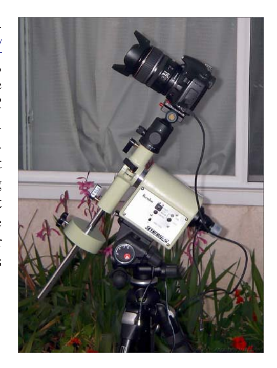
Kenko Skymemo mount

Yet another light weight travel mount is the Kenko Skymemo single-axis mount available from Hutech (<a href="http://www.sciencecenter.net/hutech/">http://www.sciencecenter.net/hutech/</a>). Again, this is not your usual GEM. Due to its dual arm configuration, it can carry two cameras at once, or one with a counterweight. The capacity of this mount is about 11 lbs. It tracks in RA and any DEC adjustment must be though the head on the tripod or on the camera. The polar scope is built in and it comes with a dedicated mini-tripod. There is a good review of the mount on Cloudy Nights and it points out some of the mount's strengths and shortcomings. Overall, the tracking was quite good, but trying to get the mount polar aligned with the short tripod was a challenge. Some sort of adapter would be needed to use another tripod with longer legs. One feature not seen with the other mounts mentioned here (other than the GM8) is that a DEC motor is available as an option which allows guiding.