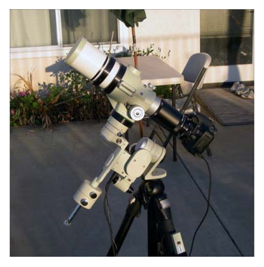
Takahashi Sky Patrol II

Another lightweight mount, designed for travel, is the Takahashi Teegul Sky Patrol III. This mount is the latest in a series of lightweight mounts that Takahashi has made over the years. It is a bit hard to track the development of these mounts due to the relative lack of information on the web, but I think the first one was the P2 mount, which was followed by the P2S, Space Boy, P2Z, Sky Patrol I, Sky Patrol II and the latest, the Sky Patrol III.