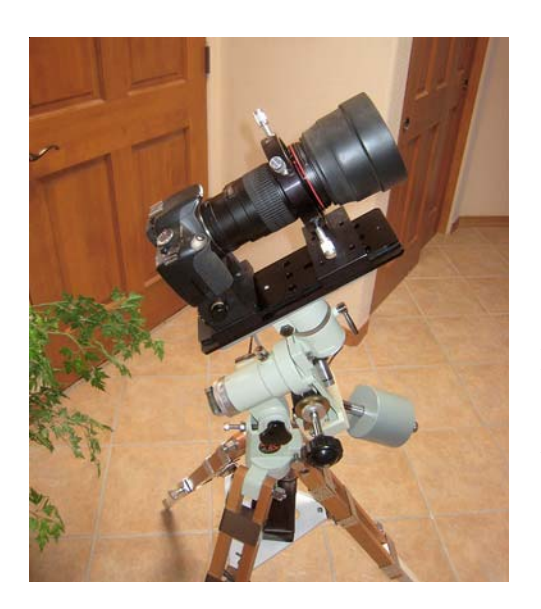
Takahashi Space Boy mount with 200 mm lens

So what did I buy? Cost was not a big differentiating factor. Most of the mounts listed above cost around $1000. The Tak P2Z is about twice that amount, but is probably the best mount of the group. Like so many other things in this hobby, more money is often the solution to most problems! I was certainly interested in the Astrotrac because of its compactness and lightweight, but I had concerns about the difficulty of getting a good polar alignment. The Hutech Kenko mount also looked interesting, but again, it had polar alignment issues. So, I ended up buying a used Space Boy mount on Astromart. Part of my decision was based on the fact that it was available used and the others were not at the time.