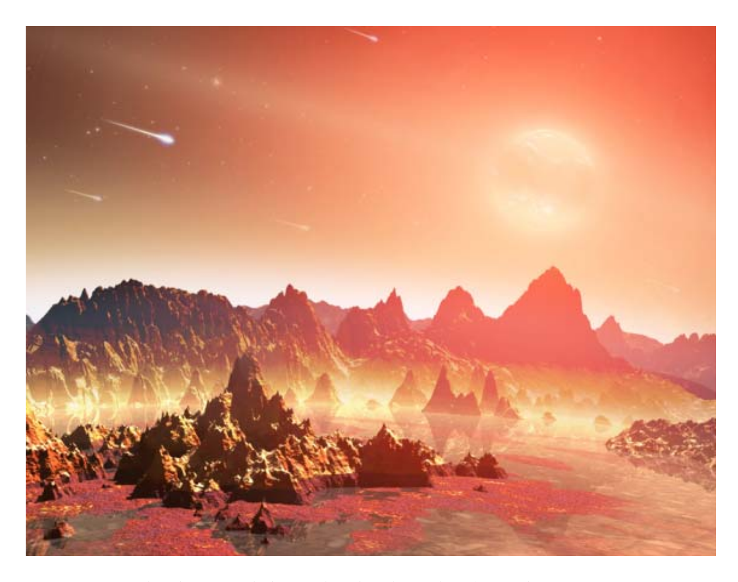
Do alien planets around other stars have the right ingredients for a pre-biotic soup?

Alien life on distant worlds. What would it be like? For millennia people could only wonder, but now NASA's Spitzer Space Telescope is producing some hard data. It turns out that life around certain kinds of stars would likely be very different from life as we know it.