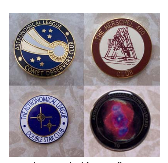
Astronomical League Pens

I'm currently working on the Caldwell Club list and a big part of my personal enjoyment in observational astronomy comes from planning the night's activities. This includes examining star charts for locations, reading descriptions of the objects, and reviewing photographs. Observation guides, like Stephen O'Meara's Deep Sky Companion series, are a wonderful resource for this. Locating some objects can be challenging and the thrill of the hunt can quickly turn to frustration without a little help from time to time. Observation guides usually provide step-by-step instructions for locating difficult objects. The actual observation is also much more interesting when you know a few details about the target. I find that I can usually resolve more detail when I've seen a photograph and know exactly what that dim object should look like. (Can I resolve the knot in the spiral arm or locate a dim companion galaxy?) Using averted vision and varying the magnification can also help tease out additional detail on dim