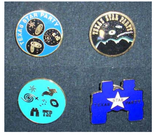
Texas Star Party Pens

the TSP Observation Committee puts together. These include the standing TSP binocular observation programs, as well as telescope observation programs that are added each year. The telescope observation programs often follow themes like two objects in the same field or peculiar galaxies, and are usually spread though out the evening hours to give observers adequate time to locate and study the objects over the course of the week. These programs are designed to provide a challenge for observers of all levels with some oriented toward the beginning observer and others for more advanced observers that often require larger aperture and a keen observing eye. For example, there are three regular binocular observing programs: the TSP Binocular Observing Program (pick any 25 objects), TSP Challenge Binocular Program, and the infamous "TSP Binocular Program from Hell." All observations