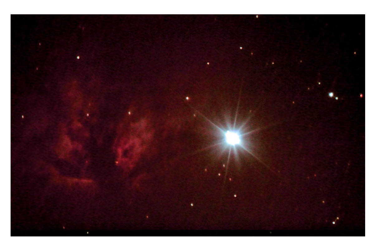
The Flame Nebula (NGC 2024) with Alnitak (double star very visible in original image) 60 seconds, ISO 3200.