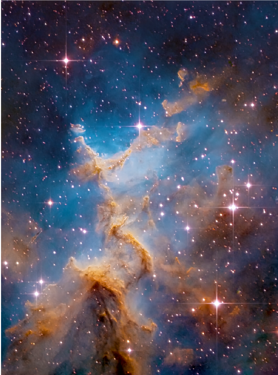
Detail from inner region of IC1805