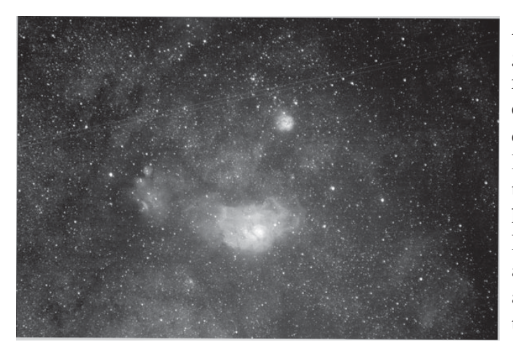
M8, M20 and IC1275 taken on a night with a full moon using and Ha filter

A final benefit to imaging in Ha is that since you are gathering only the Ha light, star bloat is greatly reduced. Point sources like stars during long exposures tend to saturate. Since you are only capturing a single wavelength of light their luminosity is greatly reduced so it takes much longer to saturate. This is a real boon to those of us who have non anti-blooming gate cameras. Since the Ha components of your target are being captured at almost 100% but the stars are being recorded at a greatly reduced luminosity you can image your target much deeper before blooming begins.