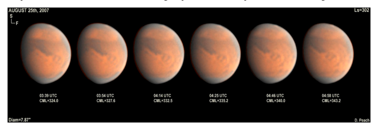
Recent views of Mars.

2007, the apparent diameter of Mars will be more than 4 arcsecond smaller than it was at the same period in 2005; however, it will be 10 degrees higher in the sky - much better for observing the Red Planet -helping to make up for the smaller size. June 2007 through April 2008 are the prime Mars observing months.