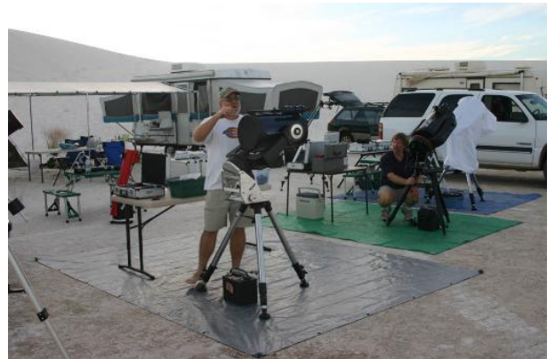
Below Right: Beautiful home-built mount