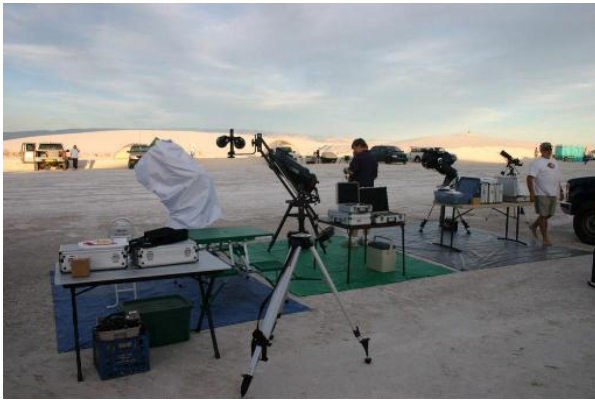
Left & Right: ASLC Camp