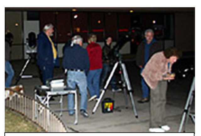
On Saturday evenings around the first-quarter moon, club members host our monthly Moon Gaze event in front of The International Delights Cafe on El Paseo.

Although some ASLC members collect scientific data, most of us do astronomy for fun. For example, the ASLC hosts public observing events such as our monthly MoonGaze and dark-sky observing at the club's observatory in nearby Radium Springs, NM. We also support countless star parties for local schools, scouting groups, and other organizations. For new telescope purchases, the ASLC is always willing to help with equipment recommendations and/or training. And, for those members who don't own a telescope, we offer the free use of equipment via our telescope loaner program. Our monthly club meeting is usually on the fourth Friday of each month. Please feel free to join us!