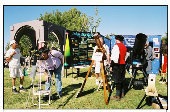
Participants view the sun and bright planets at ASLC's booth at the annual Renaissance Faire.

Renaissance Faire: Each November, the Las Cruces Fine Arts Council hosts a Renaissance Faire at Young Park. The two-day event draws thousands of local residents. ASLC has been a participant for the last several years. The club sets up telescopes through which individuals can safely view the sun. We also display astrophotography, demonstrate telescope building, and talk with hundreds of interested individuals about club activities (all the while wearing period costumes). In 2004 and 2018, the club won awards for having the best-costumed booth. It's great fun!