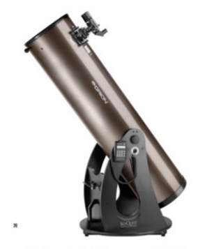
Orion Intelliscope (12")